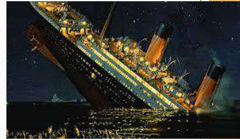
Women, children, and aged first