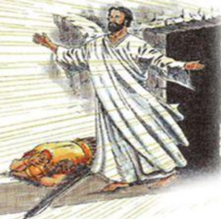
2 Corinthians 3:6